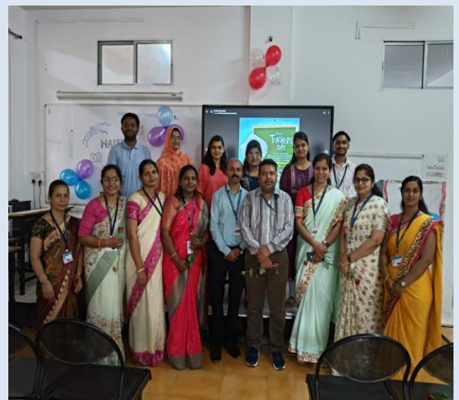
Teacher’s Day Programme Organized by BCA and MCA students