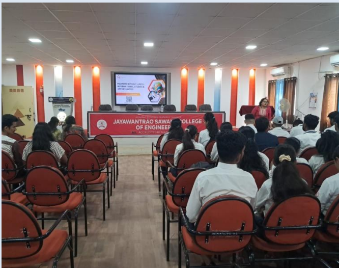
Expert session on Higher education and placement opportunities at abroad