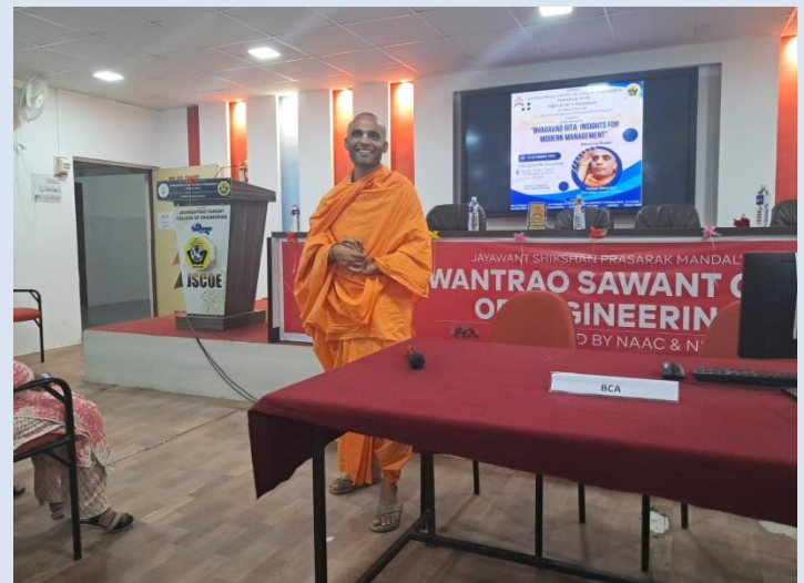
One Day Workshop on Indian Knowledge System – Bhagwadgita Insights for modern management