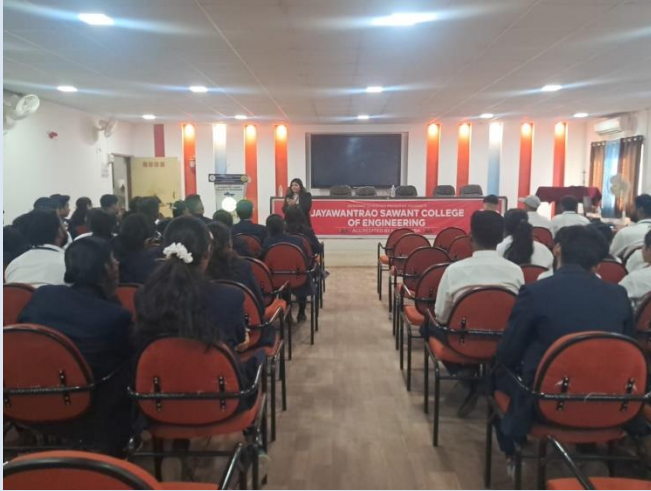
Workshop on Latest Career opportunities in IT trends , Internship & Placements by Code IT Solutions