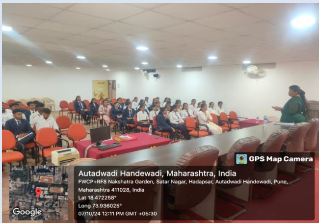
Workshop on Job Application Essentials by IBM Skill Build