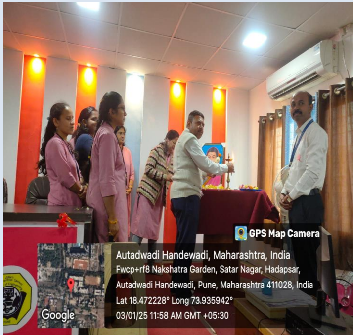
“Savitrijiyoti” Empowering Women’s Education on the occasion of Birth Anniversary of Savitribai Phule