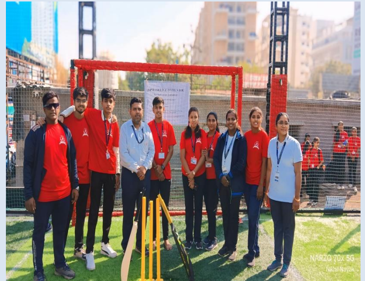
Turf Cricket Tournament 2024-25 Winning Team