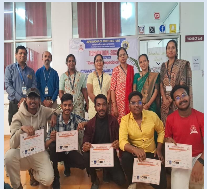
TECHMANTHAN-2025 Gaming Competition Winners