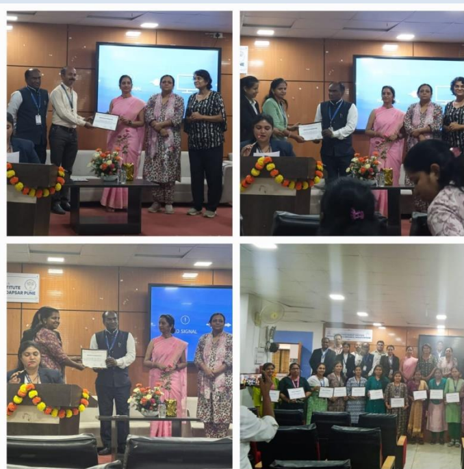
BCA & MCA Dept. Staff Actively participated in Workshop on Innovative Teaching Methodologies and Experiential Learning