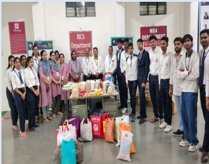
Collection of Daily Needs items for donation to Orphanage Visit “Dharmaveer Sambhajoraje Pratishthan’s Orphanage”